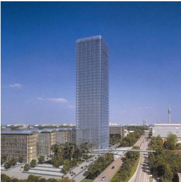
General View (Simulation Architect)