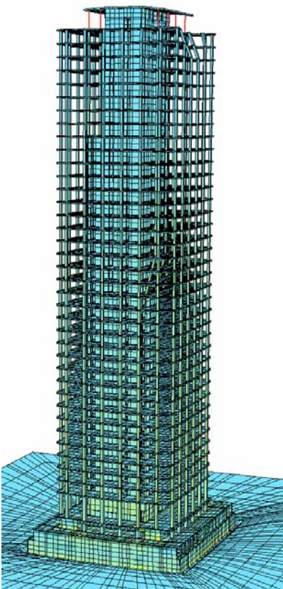
Computer model of complete structure inc. soil