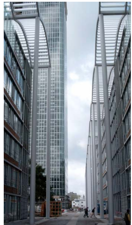
View from Campus